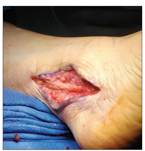
Figure 3 - Final picture of tibial nerve wrapped with AlloWrap DS with Monocryl sutures in place

The patient underwent a revision tarsal tunnel decompression eight months after the initial operation. After all scar tissue had been excised and a complete tarsal tunnel decompression had been performed, AlloWrap DS was trimmed