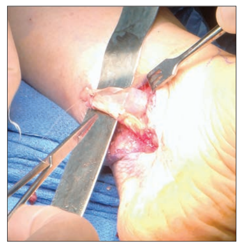
Figure 2 - AlloWrap DS being placed around the tibial nerve.

started physical therapy at five weeks post-operatively. Ten weeks after the surgery, the patient began having increasing symptoms consistent with recurrent TTS. She was found to have a thickened, immobile cicatrix over the surgical incision, and the patient was sent back to physical therapy for manual mobilization of the scar tissue. The patient continued to have paresthesias radiating distally from her tarsal tunnel and a positive Tinel's sign over her tibial nerve for the next six months after the initial surgery. She had a repeat MRI six months postoperatively that showed no recurrence of the soft tissue mass and no space occupying lesion. The patient also had repeat electromyography and nerve conduction studies that were normal. The patient had a diagnostic and therapeutic kenalog and local anesthetic injection in the tarsal tunnel seven months after the initial surgery to see if it would provide relief. This injection provided temporary pain relief, but her symptoms recurred within one week. It was therefore recommended the patient have a repeat tarsal tunnel decompression, and AlloWrap DS be used around the tibial nerve to provide a protective barrier.